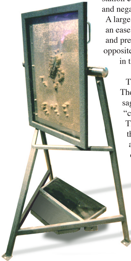
Im-Pression at “ARTworks” Kalamazoo Institute of Art

This exhibit appeals to all ages and is enjoyed equally by the visitor and spectators watching the magic of the image appear. When the image is complete the picture is tilted down, erasing the image and allowing the next visitor to be an artist.